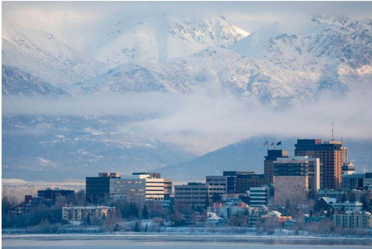
Downtown Anchorage is seen from Earthquake Park Thursday, Nov. 29, 2018.